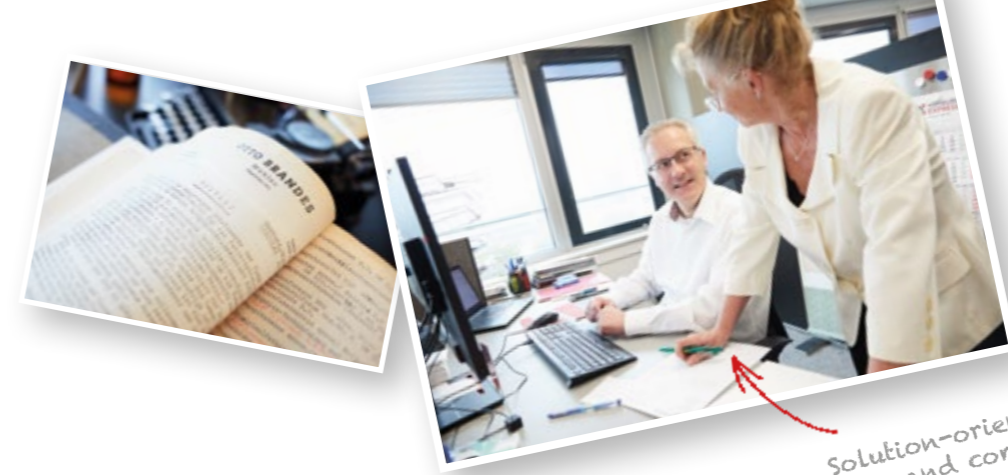
Solution-oriented and competent