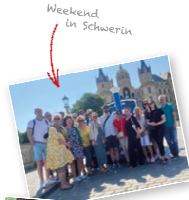
Weekend in Schwerin

"I like the flat hierarchies. My colleagues value me and I value them, I notice this everyday in my dealings and to be honest, everyday I look forward to one more exciting day at work."