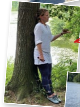
Yoga in the park