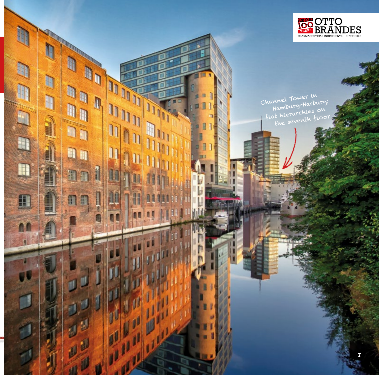
Channel Tower in Hamburg-Harburg: flat hierarchies on the seventh floor

Move to the 12th floor of Hamburger Strasse 23 (Hamburg-Mundsburg)