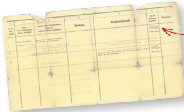
September 27, 1923: entry in the commercial register